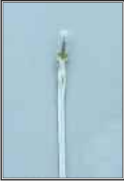
W-1 $1.75 1.5 Volt bulb