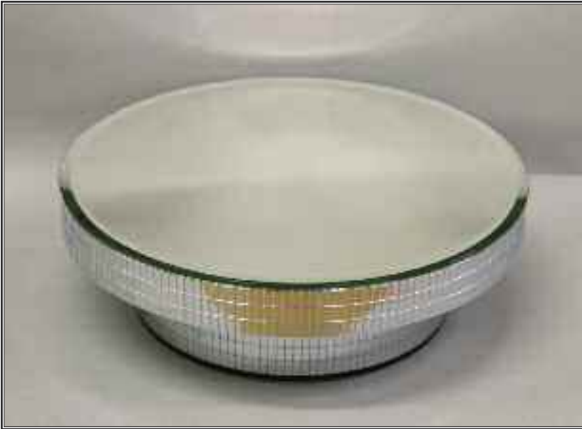
LB9 $35.00 7" W x 2 1/4" H Revolving mirrored turntable. Requires 1 "D" battery.