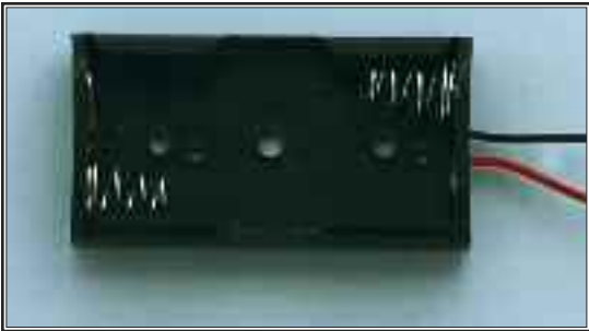
W-8 $1.25 2 "AA" Battery Pack Use with W-2 or W-3 Shown above.