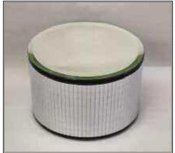
LB10 $20.00 2 1/4" H x 3 1/2" W Revolving mirrored turntable. Requires 1 "AA" battery.