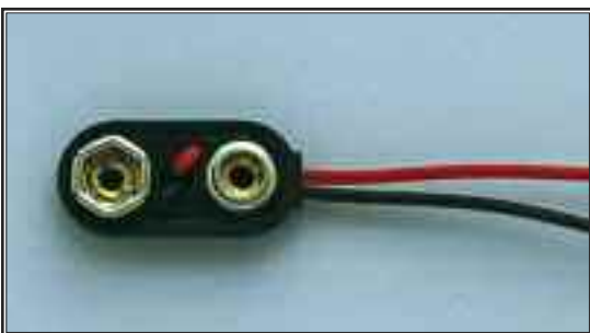
W-9 $1.25 "9 Volt" Battery Pack Use with W-4 Shown above.