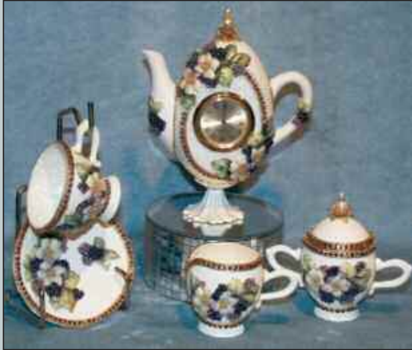
“Time for Tea”