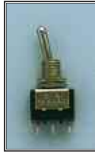
W-5 $2.75 Toggle Switch