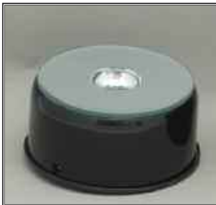
LB1 $9.99 Silver