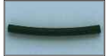
W-6 $1.25 1 ft. Shrink Tube