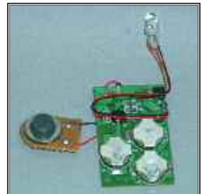
W-10 $11.20 Complete LED kit Push button activated, turns off after 30 seconds.