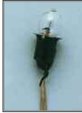
W-3 $2.25 3 Volt super-bright bulb