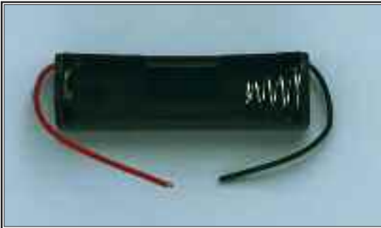
W-7 $1.25 1 "AA" Battery Pack Use with W-1 Shown above.