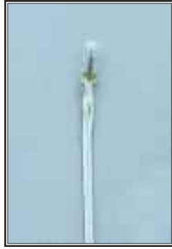
W-2 $1.75 3 Volt bulb