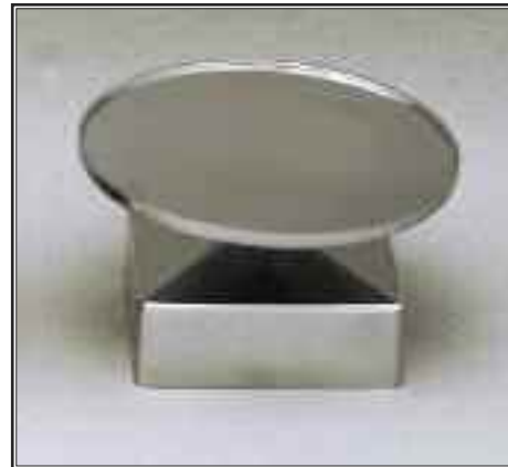
ST13 $10.00 Silver