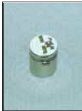
W-11 $2.50 Strobe W-12 $2.50 Solid light Twist to turn on.