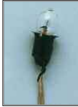
W-3 $2.25 3 Volt super-bright bulb