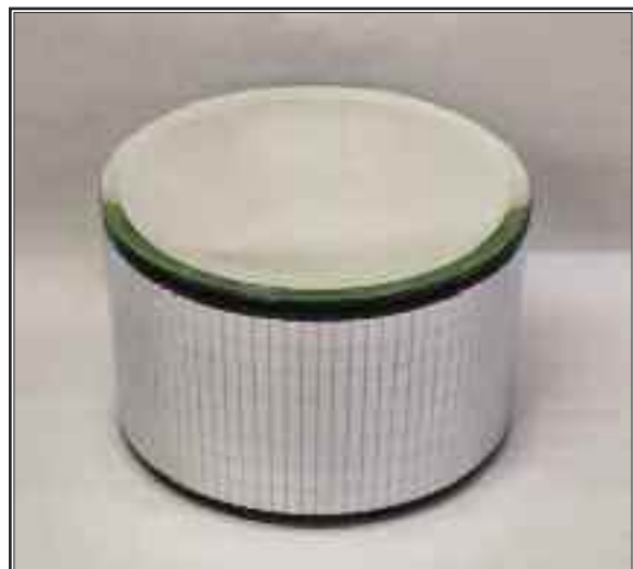
LB10 $20.00 2 1/4" H x 3 1/2" W Revolving mirrored turntable. Requires 1 "AA" battery.