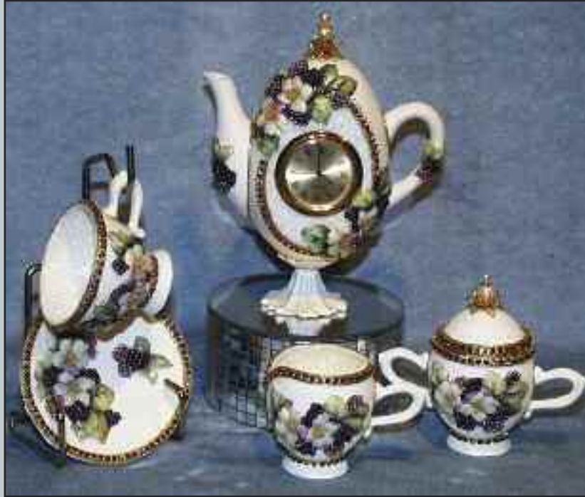
“Time for Tea”