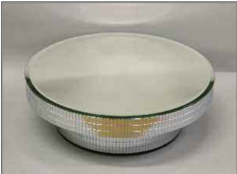
LB9 $35.00 7" W x 2 1/4" H Revolving mirrored turntable. Requires 1 "D" battery.